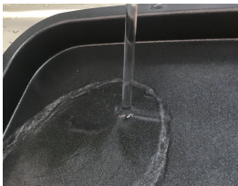
Cleaning the grill pan After removing the grill pan from the base unit, clean it in water with a soft cloth.