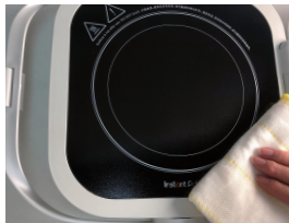
Cleaning the glass-ceramic heating surface Wipe the surface with a soft, damp cloth.