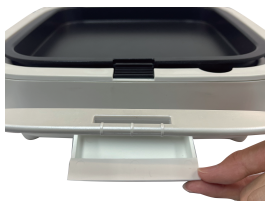
Removing the oil tray Place the appliance on a flat surface, release the catch and remove the oil tray.