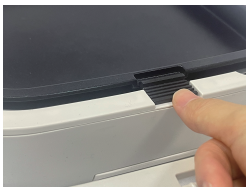
Removing the grill pan from base unit Release the catch and lift the grill pan.